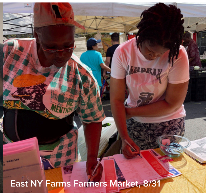
East NY Farms Farmers Market, 8/31