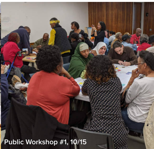
Public Workshop #1, 10/15