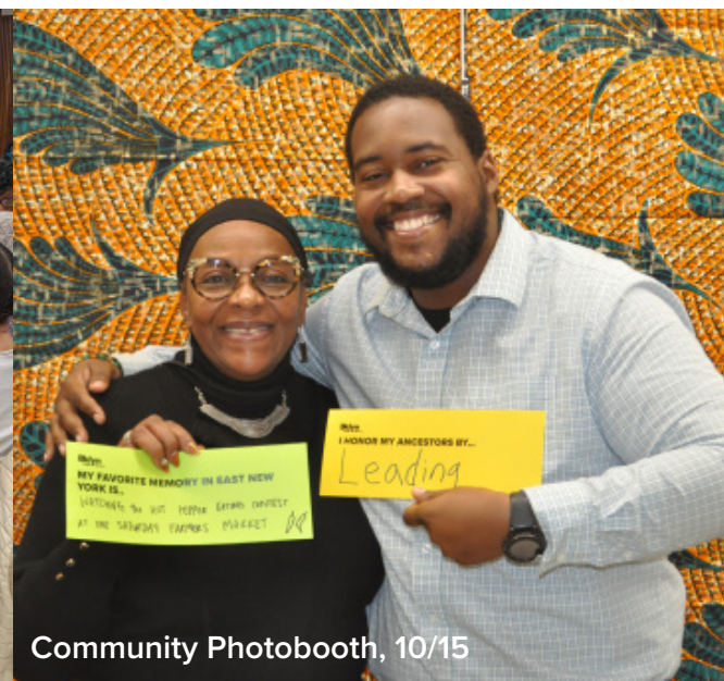
Community Photobooth, 10/15